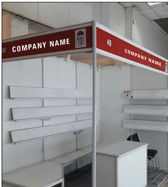
STALL 3MX2M size